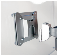
Monitor Quick Release