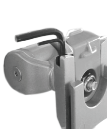
integrated allen key storage