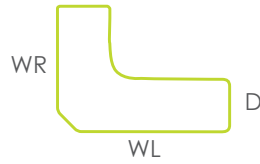
OFFSET CORNER LEFT