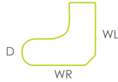
PENINSULA RIGHT (PEN RIGHT)