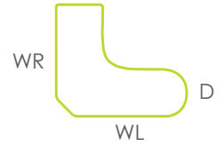
PENINSULA LEFT (PEN LEFT)