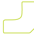
LARGE EQUAL CORNER