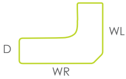
OFFSET CORNER RIGHT

*CALL CUSTOMER SERVICE FOR 120° WORK SURFACE OPTIONS.