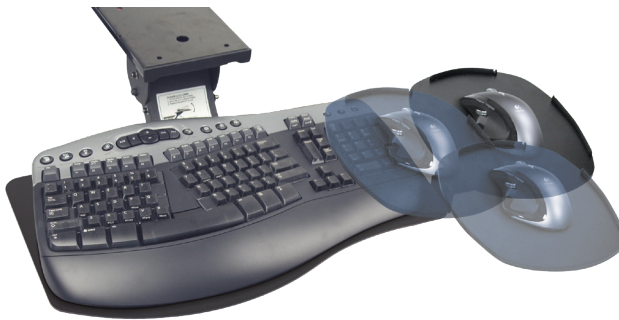
switch-and-click mouse platform can be used in three different positions.