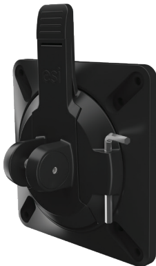
integrated tool storage