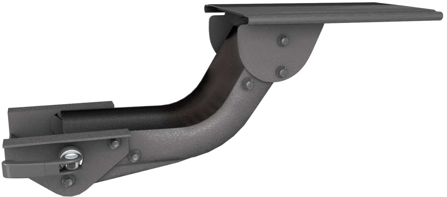
AA330 Articulating arm