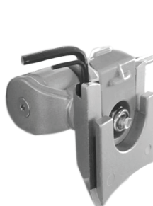
integrated allen key storage