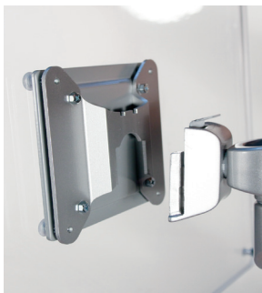
VESA quick release