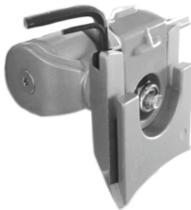
integrated allen key storage