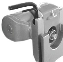
integrated allen key storage