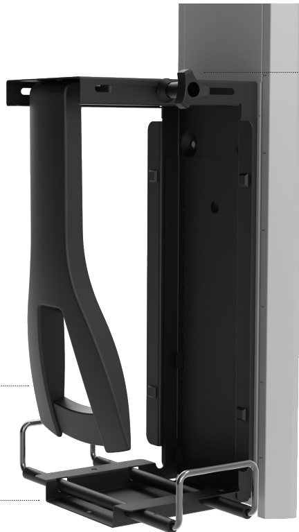
heavy duty knob