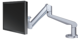
EDGE-MAX Heavy-Duty Single Monitor Arm