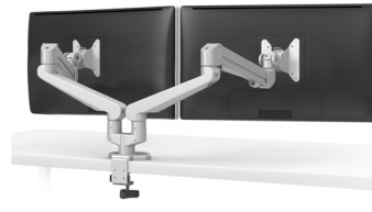
EDGE2 Dual Monitor Arms