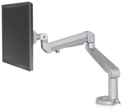
EDGE® Single Monitor Arm