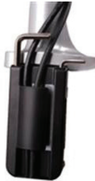
Clip-on tool storage