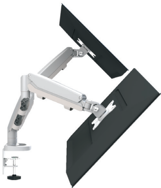
VESA mounts tilt up and down, providing a flat writing surface for touch screen monitors