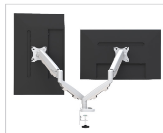
Monitors can pivot from portrait to landscape orientation easily. Arms have wide range of motion.