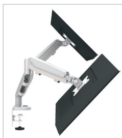
VESA mounts tilt up and down, providing a flat writing surface for touch screen monitors