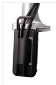
Clip-on tool storage