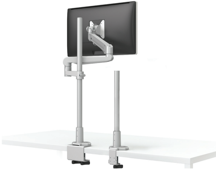
standard 18.0" pole shown on right