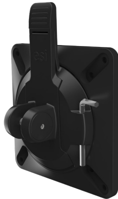
integrated tool storage