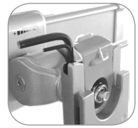
Integrated Allen Wrench Storage