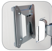
Monitor Quick Release