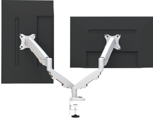
Monitors can pivot from portrait to landscape orientation easily. Arms have wide range of motion.