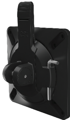
integrated tool storage