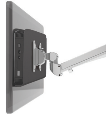
Thin Client PCs