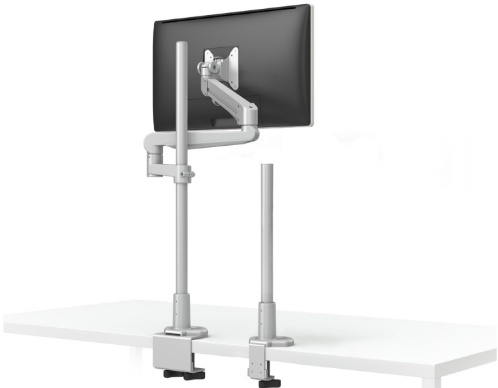
standard 18.0" pole shown on right