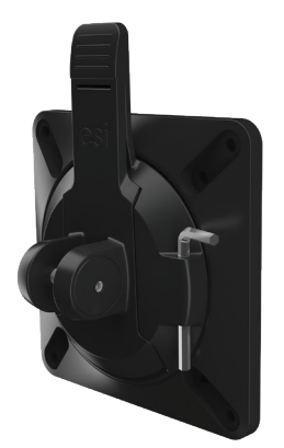
integrated tool storage