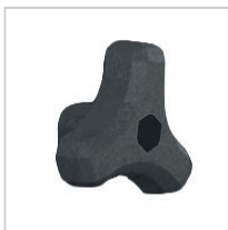
heavy duty knob