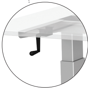
hand crank no electricity needed