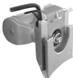
integrated allen key storage