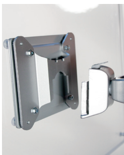
VESA quick release