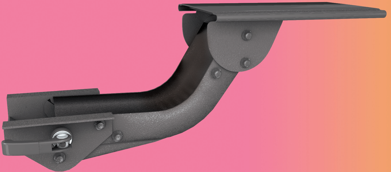
AA330 articulating arm