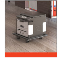
Mobile Work Tools

Offering a simple upgrade to a dual monitor arm, dynamic height adjustment, and sliders to support virtually any size monitor, the EVOLVE1-MS is a monitor arm configuration that can adapt with changing needs over time.