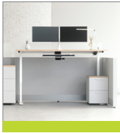
Height Adjustable Tables