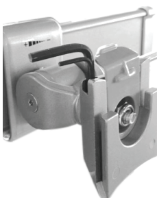
integrated allen key storage