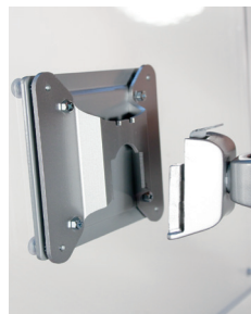
VESA quick release