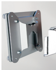
VESA quick release