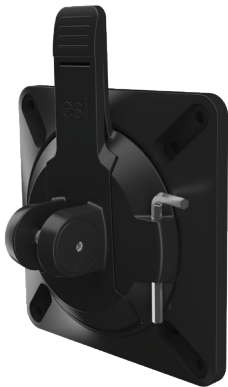
integrated tool storage