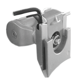
integrated allen key