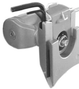
integrated allen key storage