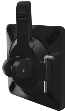
integrated tool storage