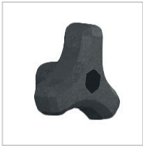
heavy duty knob