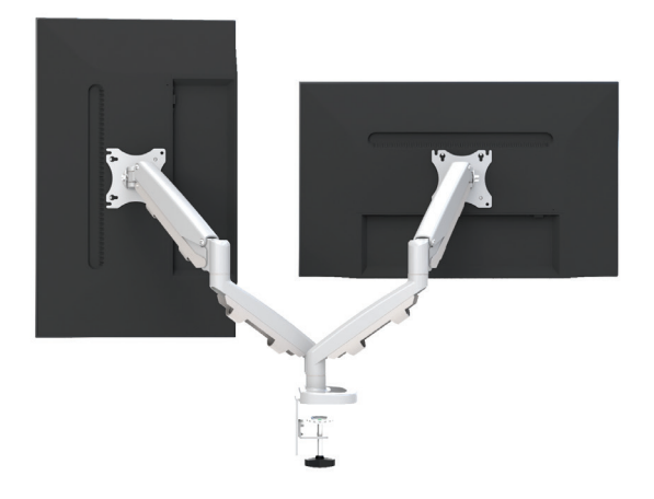
Monitors can pivot from portrait to landscape orientation easily. Arms have wide range of motion.