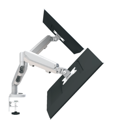
VESA mounts tilt up and down, providing a flat writing surface for touch screen monitors