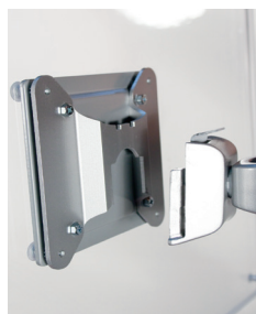
VESA quick release