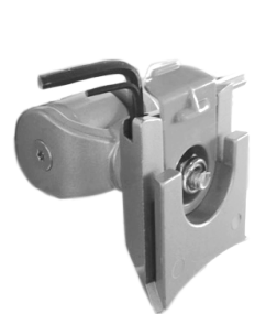
integrated allen key storage