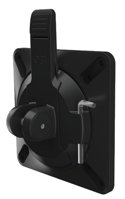
integrated tool storage